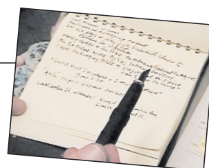
Jack Gantos discusses journaling and shows off his master journal.