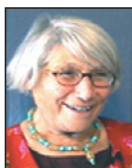
Vera B. Williams